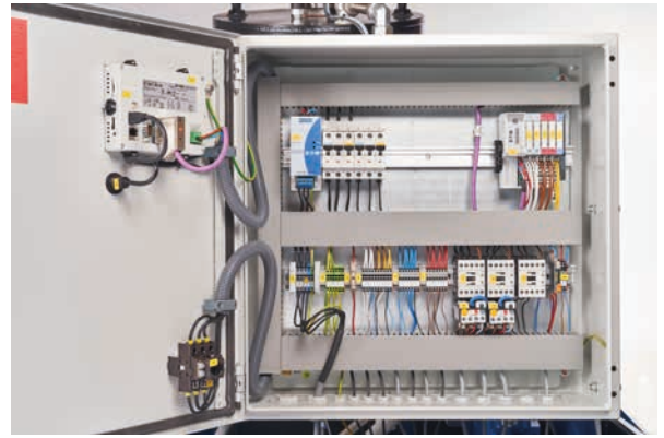
Web-enabled control unit with touch panel and USB interface